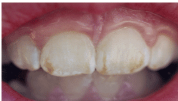
Mild dental fluorosis

The American Dental Association and the US Public Health Services' Centers for Disease Control advise that fluoridated tap water is not safe for babies. According to the NZ Ministry of Health web site nearly half of children living in fluoridated areas have some form of dental fluorosis. This is a mottling or discolouring of the teeth and is caused when a child has had too much fluoride. It is the first outward sign of fluoride poisoning.